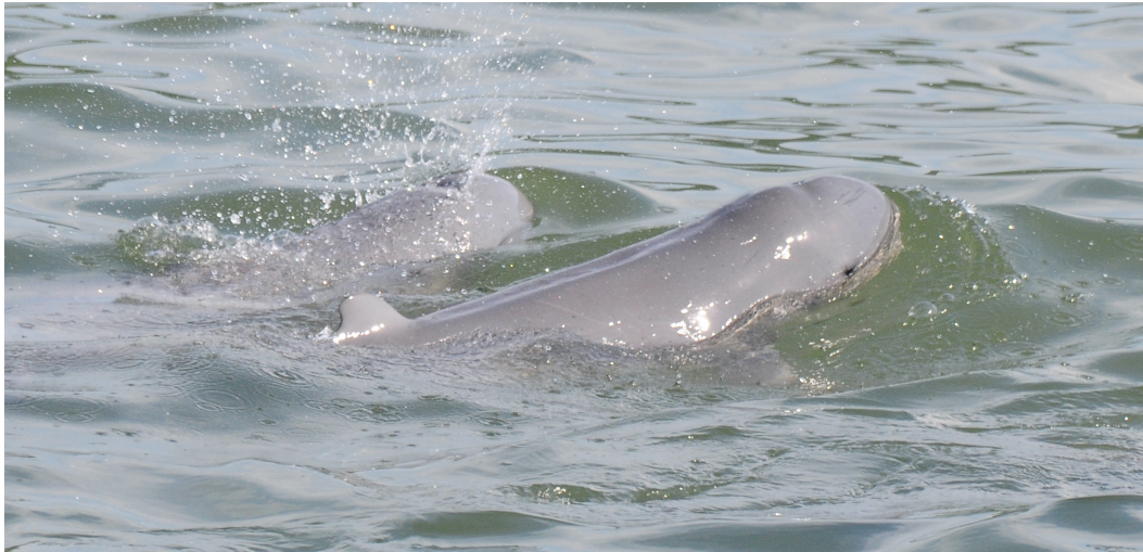
Irrawaddy Dolphins